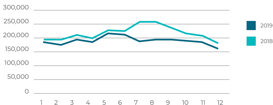
Consumption of electricity (kWh)

3.6. We are happy to inform you that BALTO print uses green energy, as 100% of our electricity comes from renewable resources.