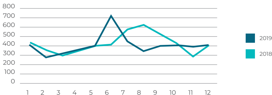
Consumption of water (m 3 )

2.2. The result should have been much better, but in summer we had to change part of our factory's cooling installation and a bigger amount of water was inevitably used.